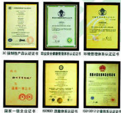
3C 强制性产品认证证书 职业健康安全管理体系认证证书 环境管理体系认证证书 国家一级企业证书 ISO9001 质量管理体系认证证书 ISO10012 计量体系认证证书

地址: 中国江苏徐州市铜山路165号 Add: No.165 Tongshan Road Xuzhou Jiangsu China 电话(Tel): 0516-83462242 83462350 传真(Fax): 0516-83461669 邮编(Post Code): 221004 网址(URL): http://www.xzxc.com.cn E-mail: xzxyx@pub.xz.jsinfo.net 服务电话(Service Tel): 0516-83461183 服务传真(Service Fax): 0516-83461180 质量监督电话 (Quality Inquiry Tel): 0516-87888268 备件电话(Spare Parts Tel): 0516-83461542 大修厂(Overhaul Factory): 0516-83461904